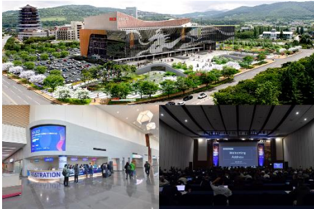
HICO & Opening ceremony.