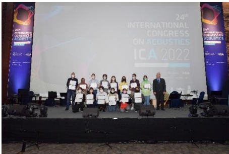
ICA-ASA Young Scientists Grants