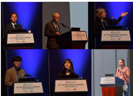
6 plenary speakers.